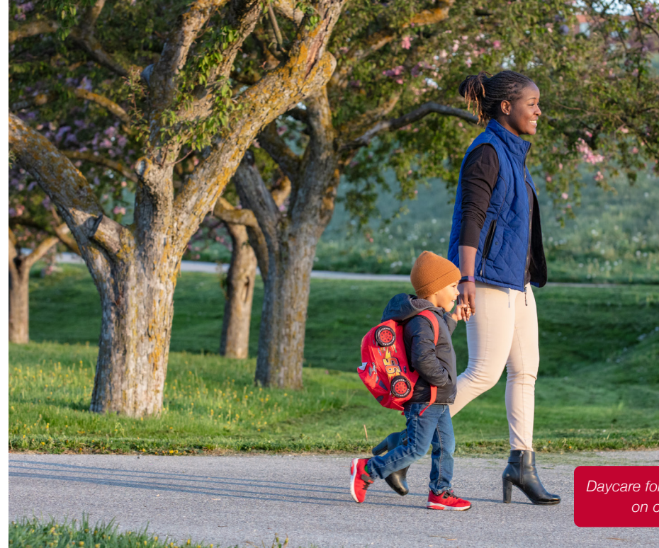
Daycare for on campus