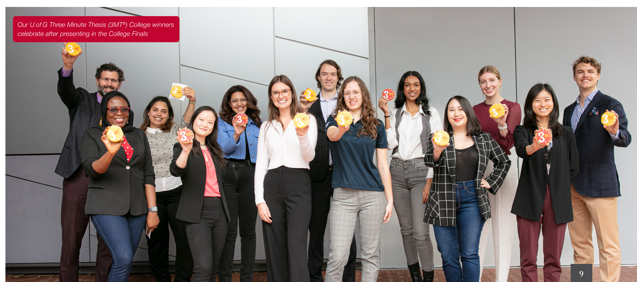
Our U of G Three Minute Thesis (3MT®) College winners celebrate after presenting in the College Finals