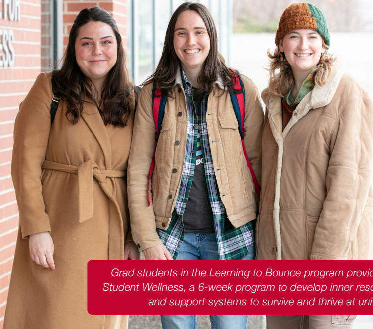
Grad students in the Learning to Bounce program provided by Student Wellness, a 6-week program to develop inner resources and support systems to survive and thrive at university