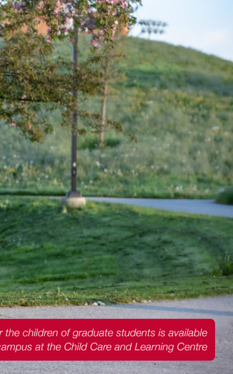
For the children of graduate students is available on campus at the Child Care and Learning Centre