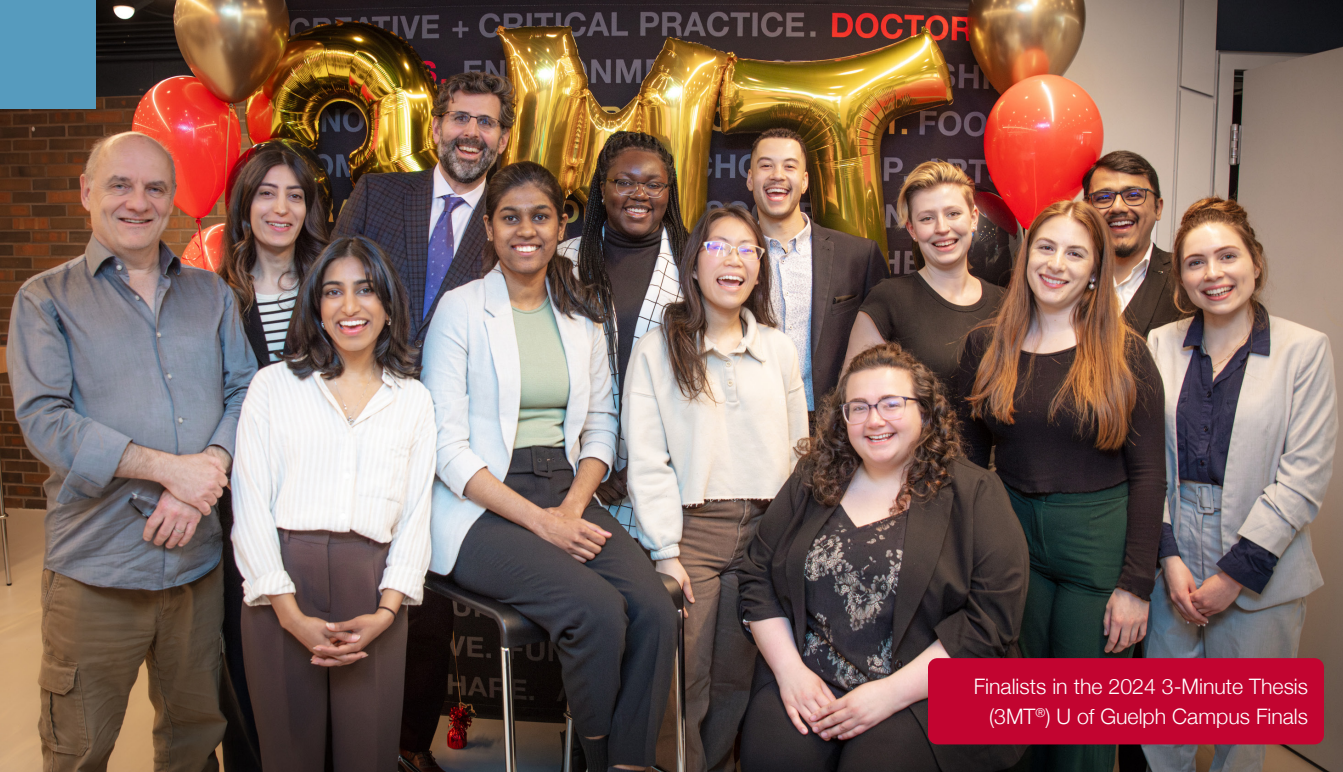
Finalists in the 2024 3-Minute Thesis (3MT ® ) U of Guelph Campus Finals