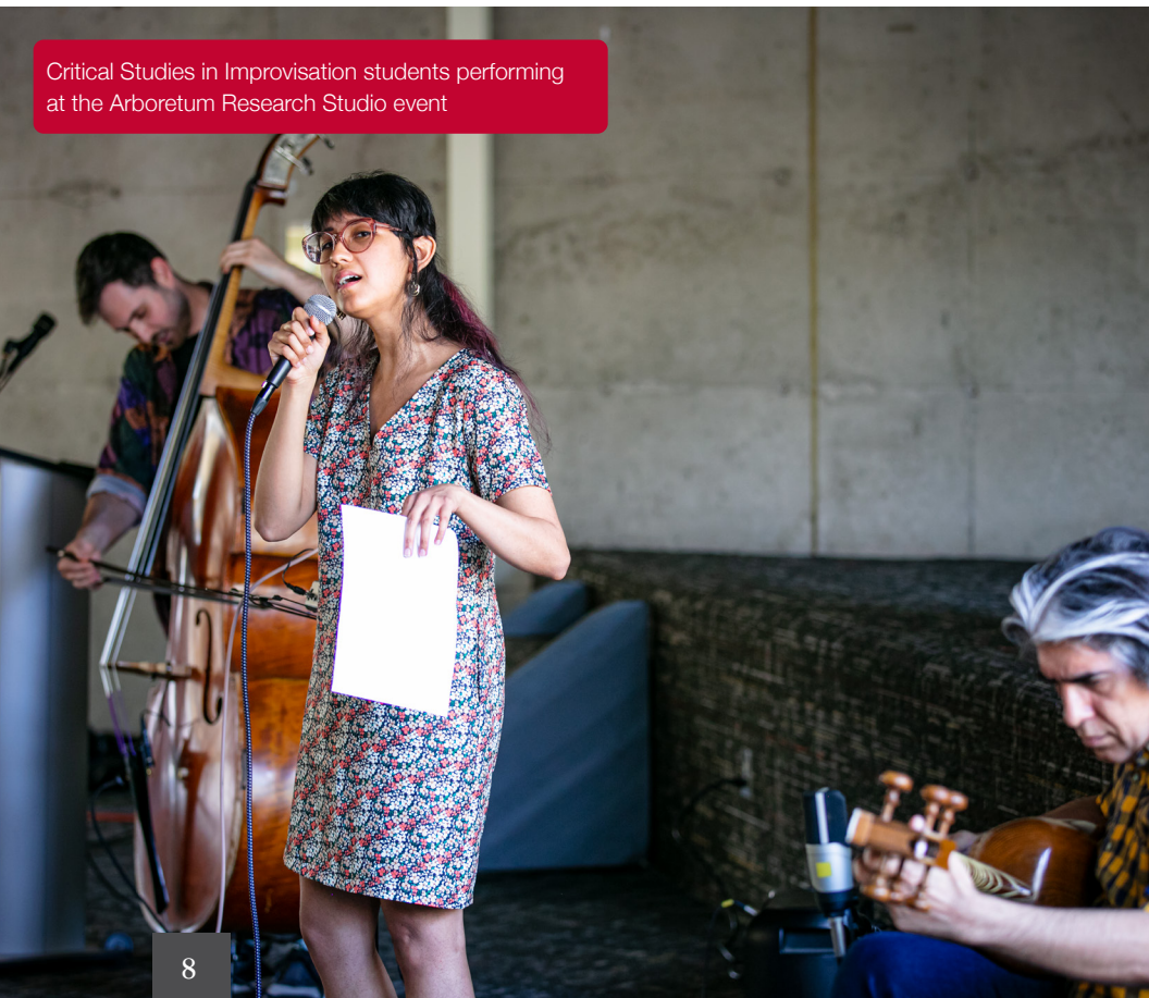
Critical Studies in Improvisation students performing at the Arboretum Research Studio event