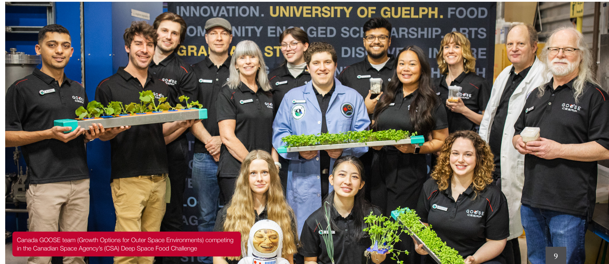
Canada GOOSE team (Growth Options for Outer Space Environments) competing in the Canadian Space Agency's (CSA) Deep Space Food Challenge