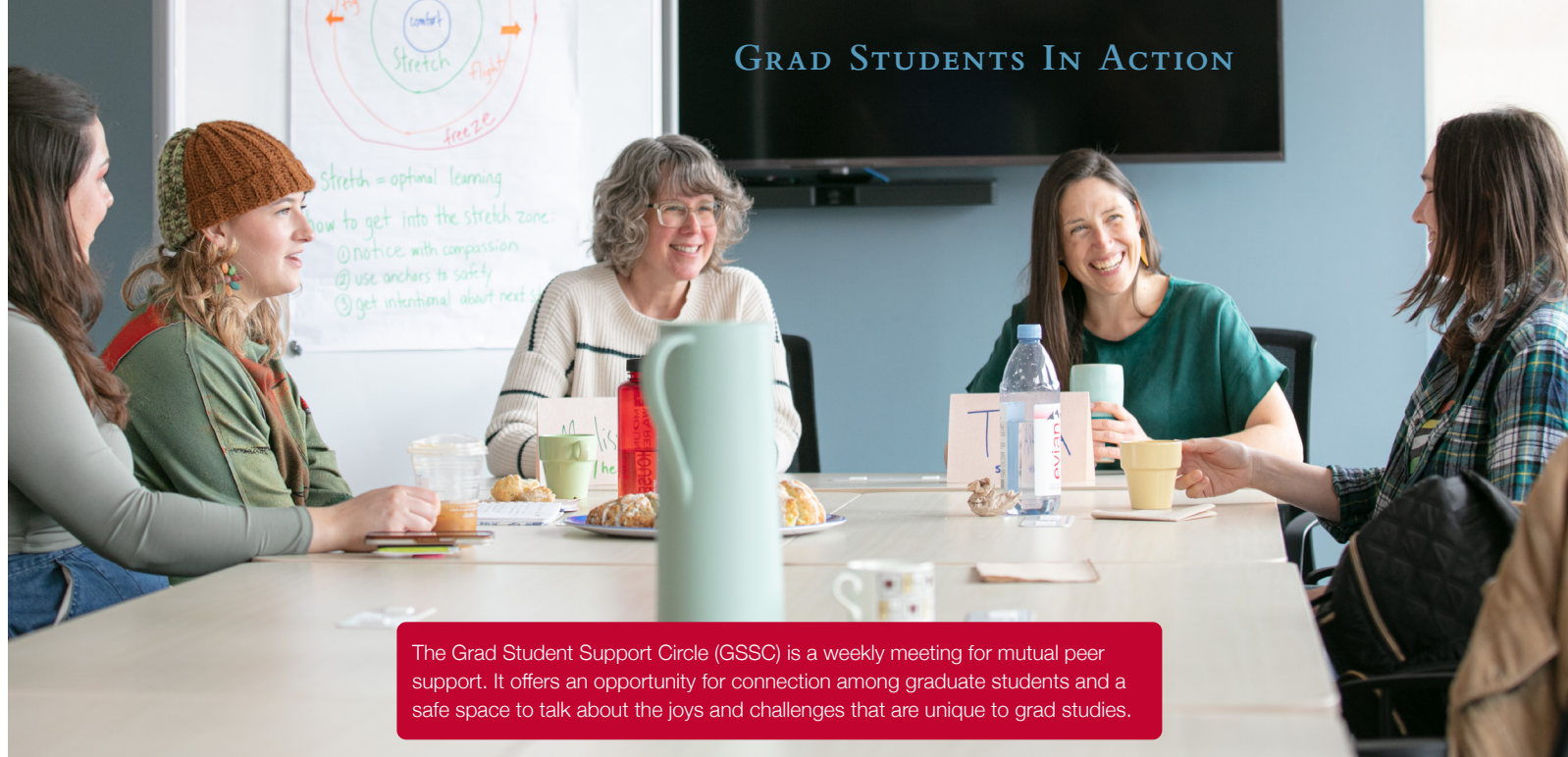
The Grad Student Support Circle (GSSC) is a weekly meeting for mutual peer support. It offers an opportunity for connection among graduate students and a safe space to talk about the joys and challenges that are unique to grad studies.