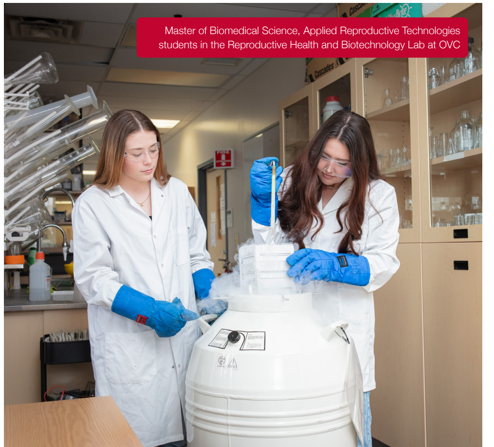
Master of Biomedical Science, Applied Reproductive Technologies students in the Reproductive Health and Biotechnology Lab at OVC