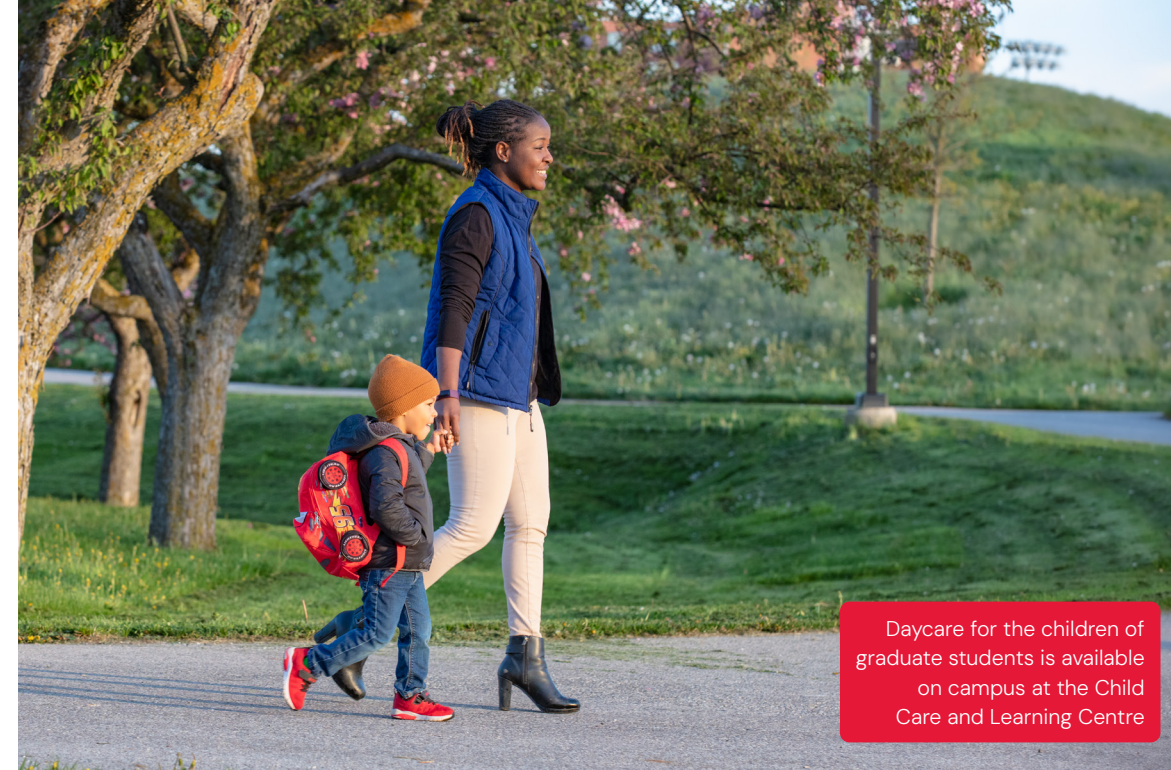
Daycare for the children of graduate students is available on campus at the Child Care and Learning Centre