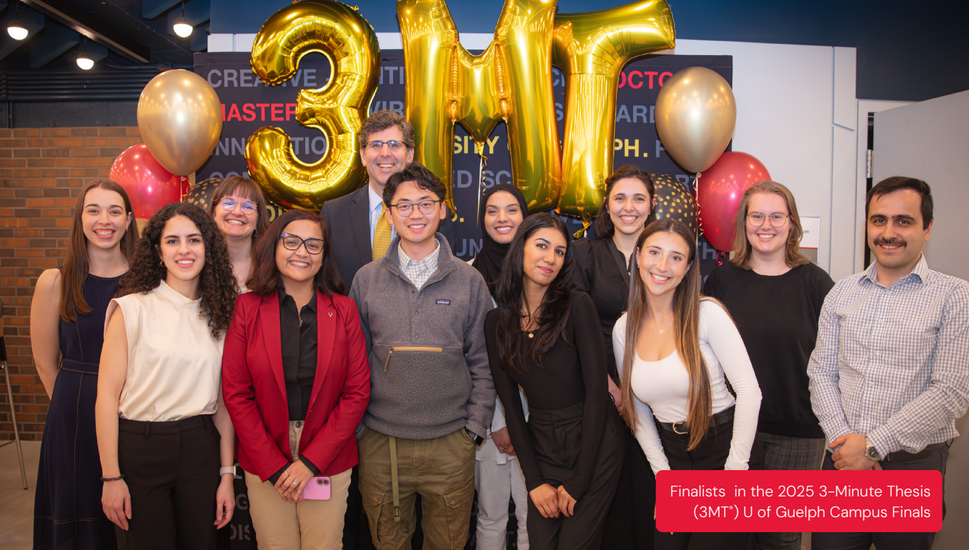
Finalists in the 2025 3-Minute Thesis (3MT) U of Guelph Campus Finals