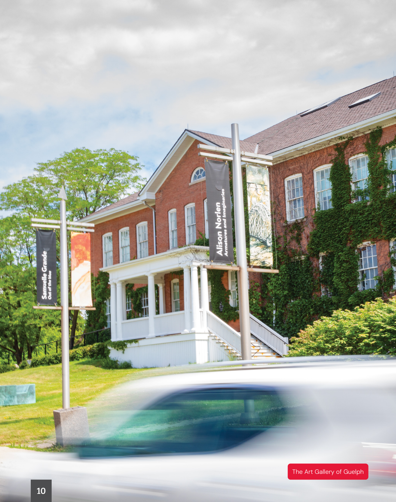
The Art Gallery of Guelph