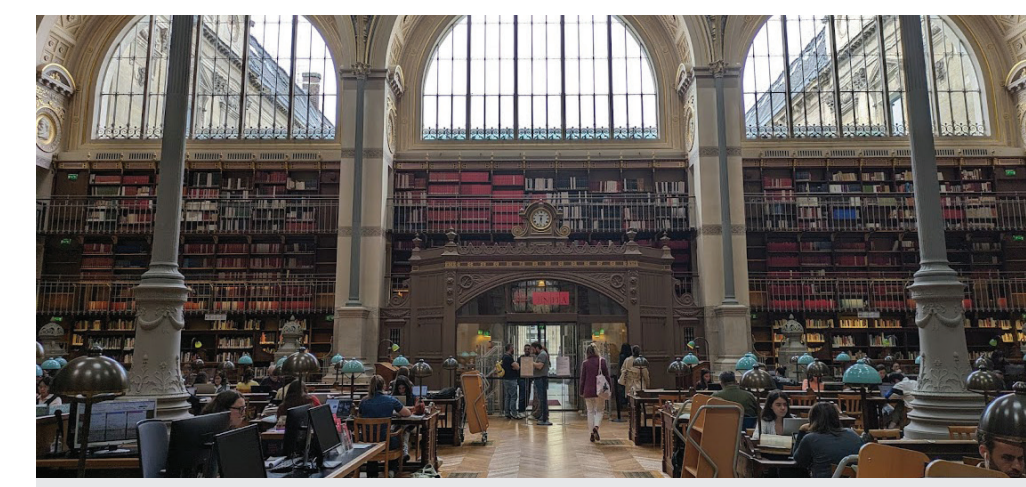
Photo of the Richelieu reading room at the Bibliothèque nationale de France. June 16 2024

The program also offers a dual degree pathway between the MA in Integrated Humanities at the University of Guelph and the MA in Linguistics and Literary Studies at Vrije Universiteit Brussel.