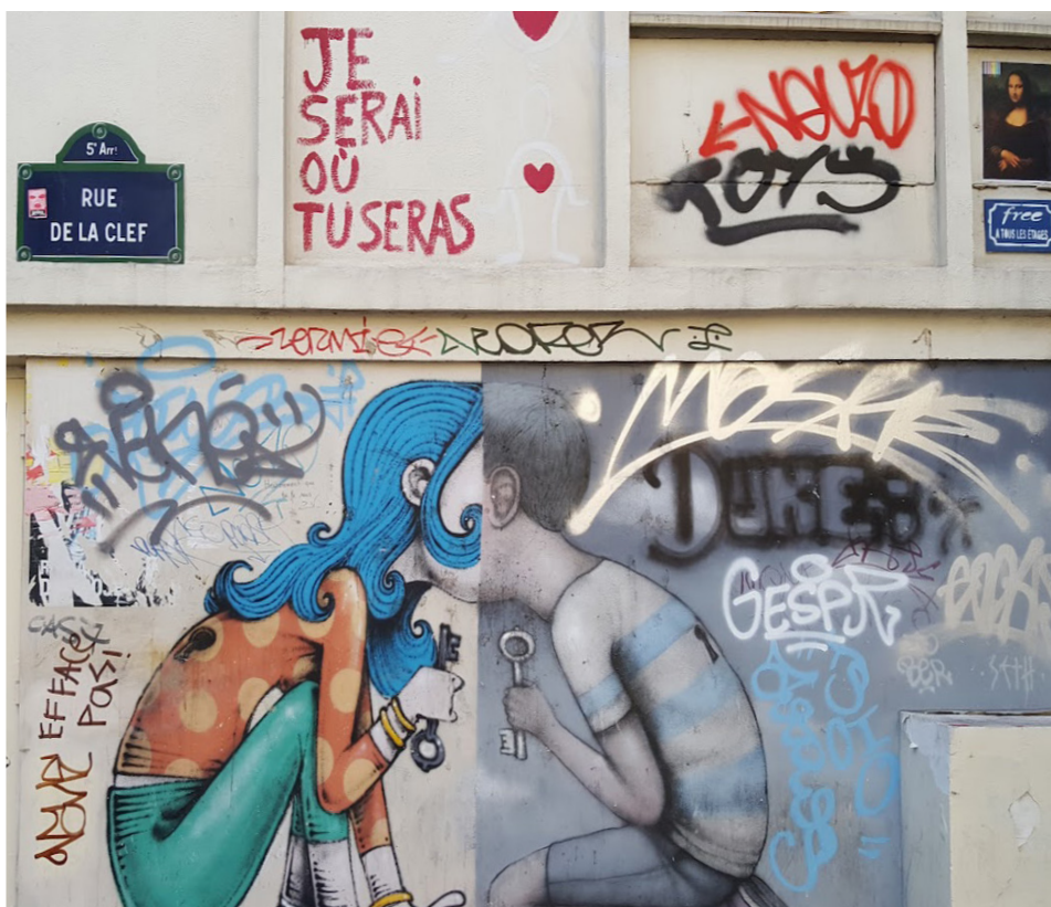
Photo of work by Parisian street artist "Seth", in the rue Mouffetard neighbourhood in Paris, November 17 2017.

Francophone Studies and Transcultural Europe is designed for students who want to benefit from both fields of study and choose to tailor their program according to their interests and goals, navigating the two official Canadian languages and cultural traditions.